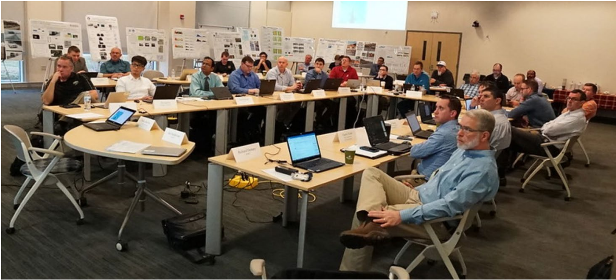
Figure 1: Photography of panel meeting on March 28, 2019 in West Lafayette, IN.

cyber security threats. His team will reach out to all participating agencies and vendors to gather other potential inconsistencies and concerns before publishing the draft version of the recommendations in the next 3-6 months. • Private sector participants provided a brief overview of the topics-of-interest for the vendor panel discussion to follow the next day. The vendor moderated panel on day 2 discussed the enumerations activities, challenges and future opportunities. Representatives from the auto industry (Audi/Ford) discussed interests of automotive industry in traffic signal performance measures