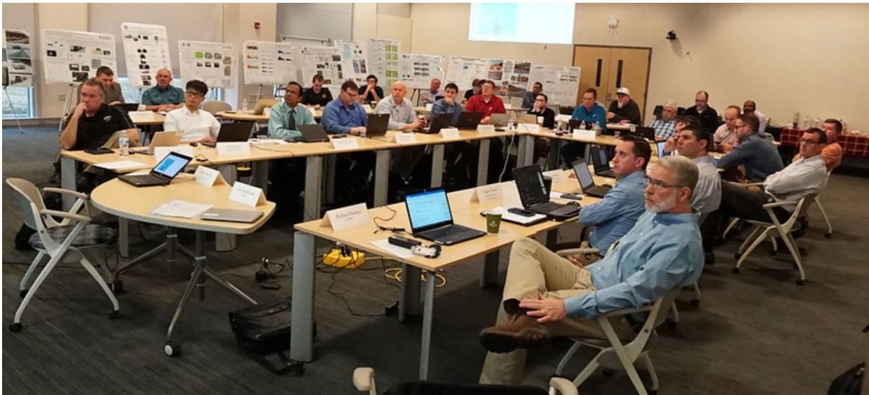
Figure 1: Photography of panel meeting on March 28, 2019 in West Lafayette, IN.