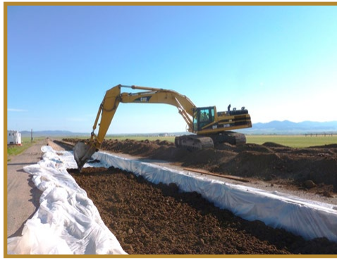
Figure 1: Filling lined trench with subgrade.

A fully-loaded, three-axle dump truck was driven at 5 mph to traffic the test sections. Measurements of longitudinal rut, transverse rut, geosynthetic displacement, geosynthetic strain, and subgrade pore-water pressure were taken during trafficking. Trafficking of the test sections was in one direction only and ran from mid-September to early November 2012 to permit 740 passes of the truck prior to winter. Trafficking continued until rut levels reached approximately 3 in. (defined as failure in this project), at which time the ruts were filled in. This allowed the remaining portions of the test sections to be trafficked until failure. Forensic investigations were conducted after trafficking to