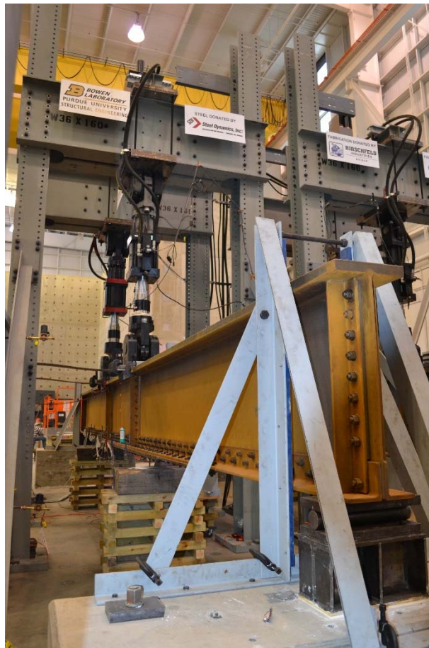
Figure 3: Specimen 36-1 fatigue test setup