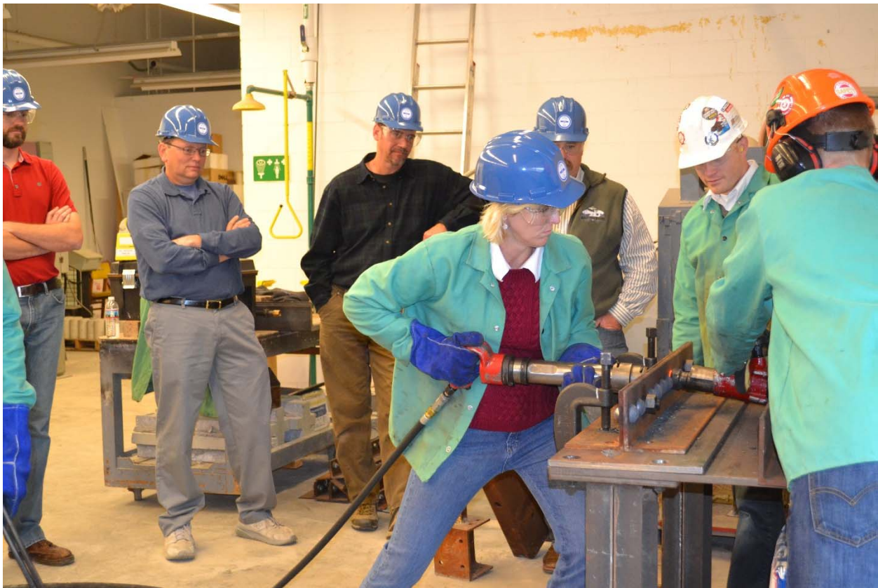
Figure 1: Interim progress meeting: riveting demonstration

None at this time. Too early in the research.